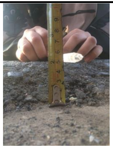
Fig.4: Road thickness