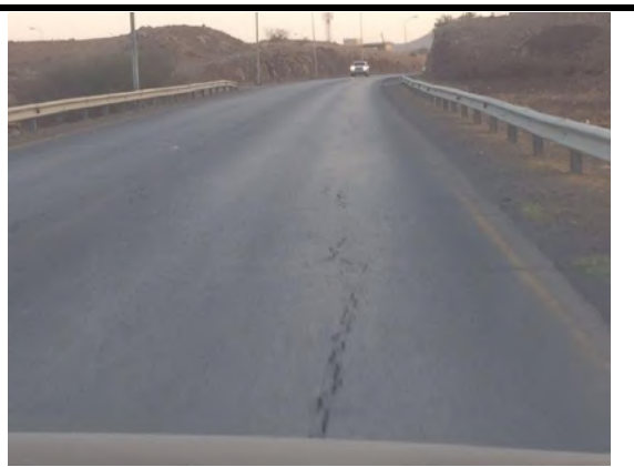
Fig.6: Longitudinal Cracks