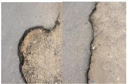
Fig.7: Edge Cracking

Edges cracking generally are parallel to the edge of the pavement. The shape of cracks is crescent or fairly continuous cracks. Edge cracks are increased due to excess traffic loads.